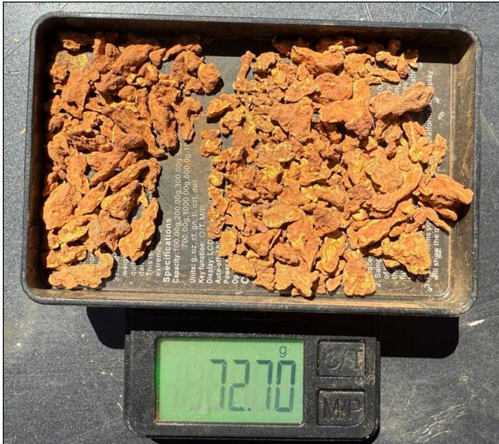
Figure 2. Recent 328 gold nugget haul